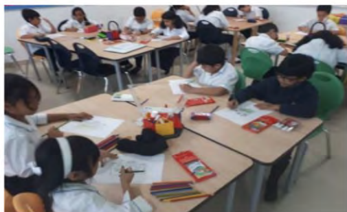
العيد الوطني السعودي الإماراتي طلاب حصص اللغة العربية