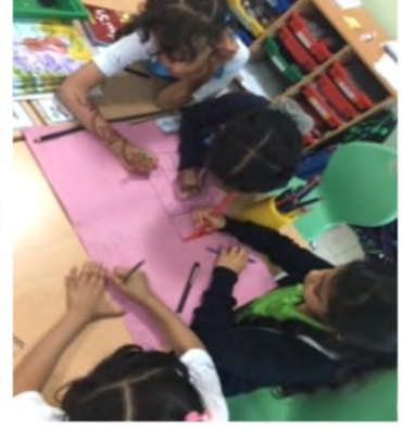
العيد الوطني السعودي الإماراتي للاطلاع حصص التربية الوطنية